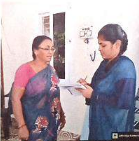
Visakhapatnam, Andhra Pradesh, India Sargoli Nilayam, 4-135, Sunder Nagar, Visakhapatnam, Andhra Pradesh 530040, India Lat 17.765852° Long 83.328129° 13/12/22 01:27 PM GMT +05:30