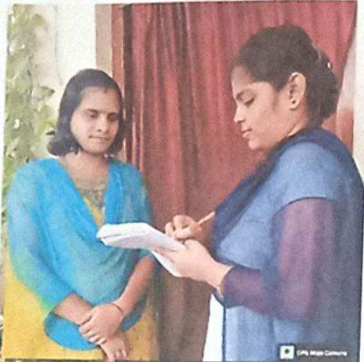
Visakhapatnam, Andhra Pradesh, India 4-205, Sundar Nagar, Visakhapatnam, Andhra Pradesh 530040, India Lat 17.765515° Long 83.32768° 13/12/22 01:21 PM GMT +05:30