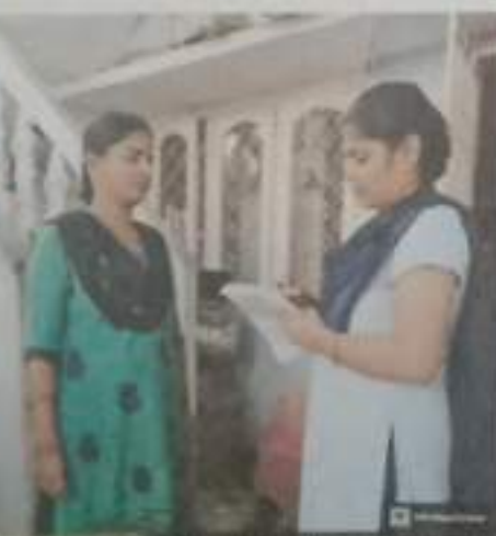
Visakhapatnam, Andhra Pradesh, India 4-901, Old Bani Park, Adarsh Nagar, Sundar Nagar, Visakhapatnam, Andhra Pradesh 530040, India Lat 17.764827° Long 83.329302° 13/12/22 02:38 PM GMT +05:30