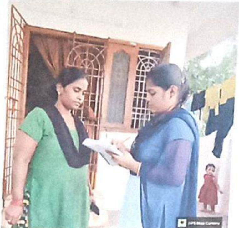
Visakhapatnam, Andhra Pradesh, India 2007, Sundar Nagar, Visakhapatnam, Andhra Pradesh 530040, India Lat 17.765239° Long 83.327797° 13/12/22 01:25 PM GMT +05:30