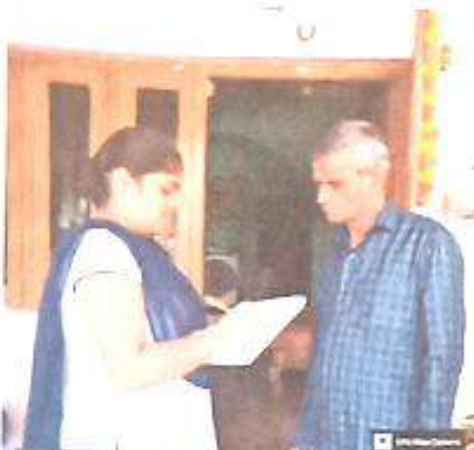
Visakhapatnam, Andhra Pradesh, India 4-108, Sunder Nagar, Visakhapatnam, Andhra Pradesh 530040, India Lat 17.764492° Long 83.328466° 13/12/22 02:23 PM GMT +05:30