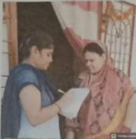
Visakhapatnam, Andhra Pradesh, India 4-108, Sundar Nagar, Visakhapatnam, Andhra Pradesh 530040, India Lat 17.764827° Long 83.329302° 13/12/22 02:42 PM GMT +05:30