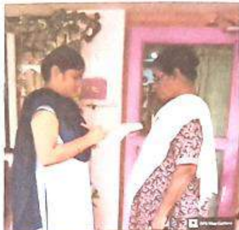
Visakhapatnam, Andhra Pradesh, India 3-264, Adarsh Nagar, Visakhapatnam, Andhra Pradesh 530040, India Lat 17.764598° Long 83.329877° 13/12/22 02:08 PM GMT +05:30