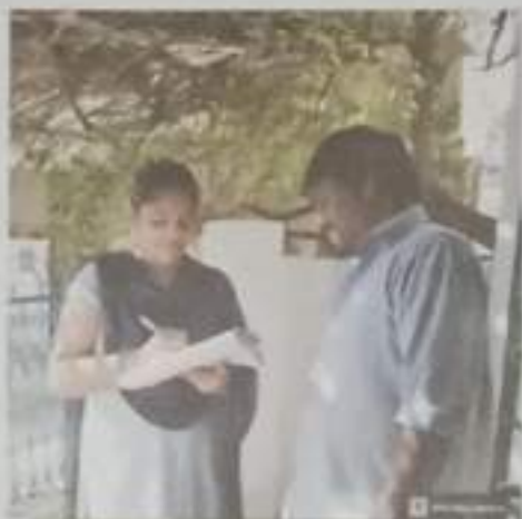
Visakhapatnam, Andhra Pradesh, India 4-56, Sundar Nagar, Visakhapatnam, Andhra Pradesh 530040, India Lat 17.764827° Long 83.329302° 13/12/22 03:29 PM GMT +05:30