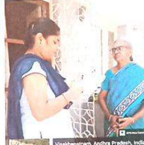
Visakhapatnam, Andhra Pradesh, India 4-14, Sunder Nagar, Visakhapatnam, Andhra Pradesh 530040, India Lat 17.764383° Long 83.328482° 13/12/22 01:49 PM GMT +05:30