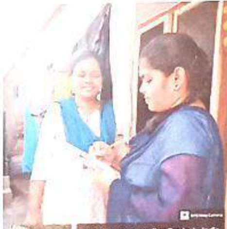
Visakhapatnam, Andhra Pradesh, India 4-182, Old Dairy Farm, Adarsh Nagar, Sunder Nagar, Visakhapatnam, Andhra Pradesh 530040, India Lat 17.764367° Long 83.328260° 13/12/22 02:41 PM GMT +05:30