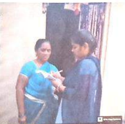
Visakhapatnam, Andhra Pradesh, India 4-182, Old Dairy Farm, Adarsh Nagar, Sunder Nagar, Visakhapatnam, Andhra Pradesh 530040, India Lat 17.764348° Long 83.328298° 13/12/22 02:45 PM GMT +05:30