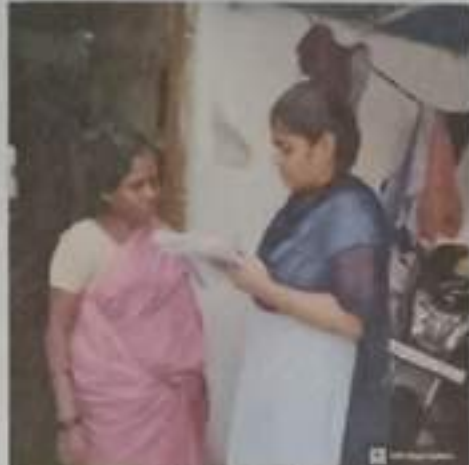
Visakhapatnam, Andhra Pradesh, India 4-201/L, Adarsh Nagar, Visakhapatnam, Andhra Pradesh 530040, India Lat 17.764827° Long 83.329302° 13/12/22 02:18 PM GMT +05:30