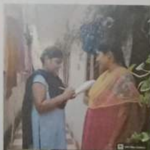
Visakhapatnam, Andhra Pradesh, India 4-11, Sundar Nagar, Visakhapatnam, Andhra Pradesh 530040, India Lat 17.764827° Long 83.329302° 13/12/22 01:53 PM GMT +05:30