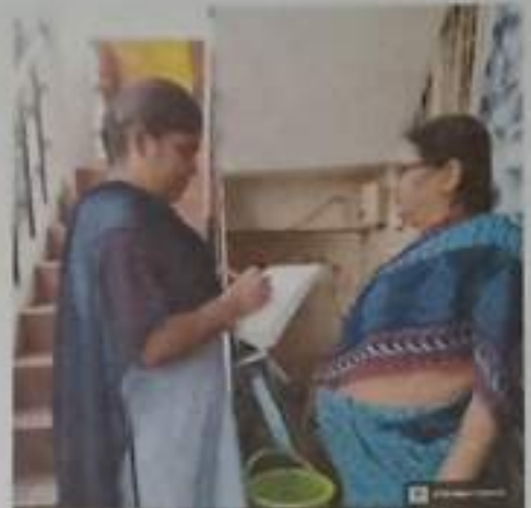
Visakhapatnam, Andhra Pradesh, India 4-102, Sundar Nagar, Visakhapatnam, Andhra Pradesh 530040, India Lat 17.764827° Long 83.329302° 13/12/22 02:40 PM GMT +05:30