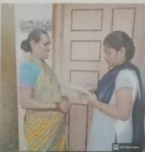
Visakhapatnam, Andhra Pradesh, India 3-29, Adarsh Nagar, Visakhapatnam, Andhra Pradesh 530040, India Lat 17.764827° Long 83.329302° 13/12/22 01:58 PM GMT +05:30