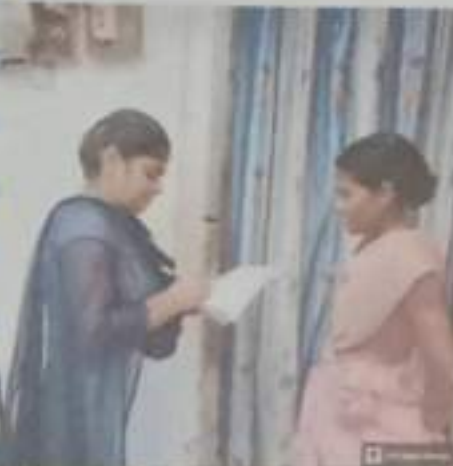
Visakhapatnam, Andhra Pradesh, India 4-206, Sundar Nagar, Visakhapatnam, Andhra Pradesh 530040, India Lat 17.764827° Long 83.329302° 13/12/22 02:48 PM GMT +05:30