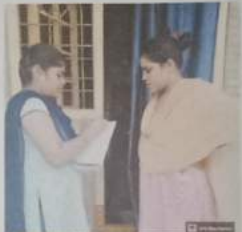
Visakhapatnam, Andhra Pradesh, India 4-56, Sundar Nagar, Visakhapatnam, Andhra Pradesh 530040, India Lat 17.764827° Long 83.329302° 13/12/22 02:18 PM GMT +05:30