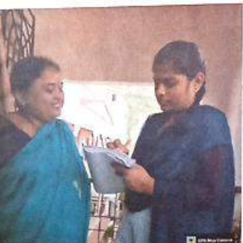
Visakhapatnam, Andhra Pradesh, India 4-167, Sunder Nagar, Visakhapatnam, Andhra Pradesh 530040, India Lat 17.764627° Long 83.328295° 13/12/22 01:35 PM GMT +05:30