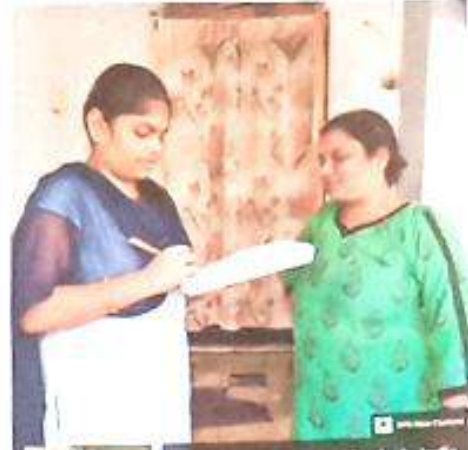
Visakhapatnam, Andhra Pradesh, India 4-158, Old Dairy Farm, Adarsh Nagar, Sunder Nagar, Visakhapatnam, Andhra Pradesh 530040, India Lat 17.76426° Long 83.327792° 13/12/22 02:35 PM GMT +05:30