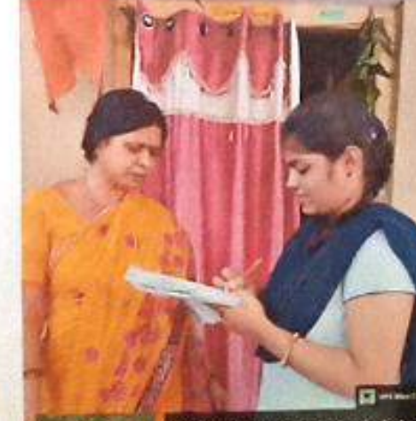
Visakhapatnam, Andhra Pradesh, India 4-337, Sunder Nagar, Visakhapatnam, Andhra Pradesh 530040, India Lat 17.764989° Long 83.328428° 13/12/22 01:30 PM GMT +05:30